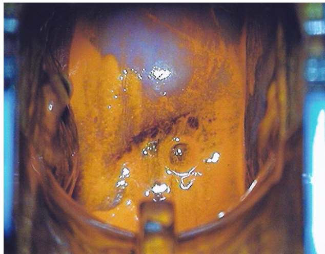
Figure 3 Intravaginal curcumin on the cervix.