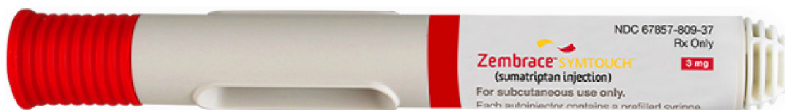
Figure 1 Zembrace® SymTouch® disposable single-use two-step autoinjector.

Sumavel® DosePro® is a prefilled, single-use, disposable, needle-free system designed for SC delivery of 6-mg sumatriptan into the abdomen or thigh through instantaneous liquid injection (Figure 2). To prepare for injection, patients snap off the gray end cap and flip down the green lever. When ready