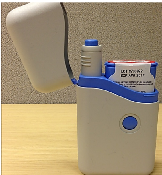
Figure 3 Imitrex® STATdose® System, the multistep, reloadable cartridge-based study device.

Imitrex® STATDose®, shown in Figure 3, is a multistep, reloadable autoinjector that delivers SC doses of sumatriptan through the use of 4 or 6 mg cartridges. To use it, patients must place the body of the device into a new cartridge pack and turn it to attach a new syringe. After preparing the injection site, the autoinjector is pressed down on the skin; sumatriptan delivery begins when the button is pressed and ends after 5 seconds. The used device is deposited into a sharps container, and the reusable items are returned to the case for future use.