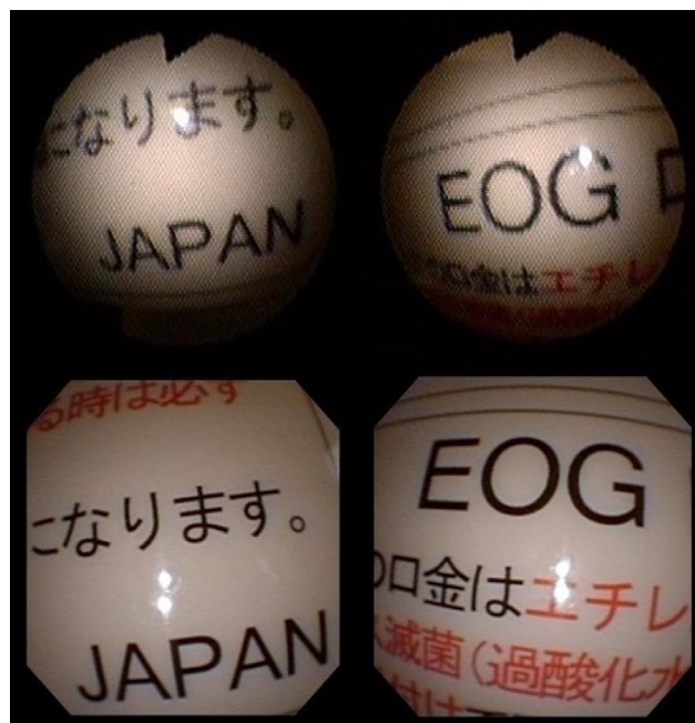
Figure 1 Images from Olympus URF-P5 (fiber-optic) on top, Olympus URF-V (digital) on bottom.

Because digital ureteroscopy utilizes the “chip on the tip” to collect information and relay it to the endoscopy tower, the bulky camera head required for nondigital endoscopic procedures is eliminated (Figure 2). In the author’s experience, the digital ureteroscopes offer improved ergonomics by being lighter and, therefore, easier to handle, something that is especially important during longer procedures where hand fatigue can become an issue. Furthermore, the reduction in scope cords from two (camera and light cord) to one helps to prevent cord entanglement and reduces clutter in the operative field. The combined cord and the elimination