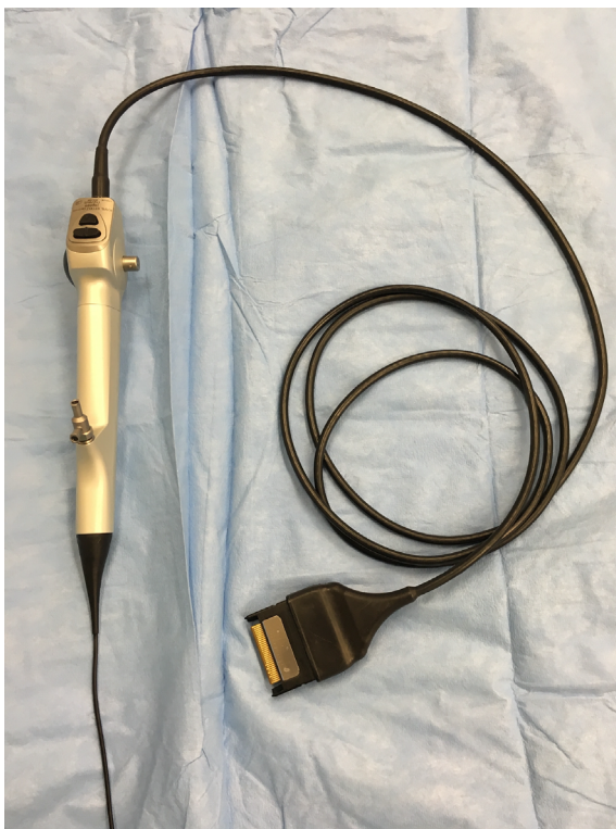
Figure 3 Karl Storz Flex Xc flexible digital ureteroscope.

Several studies have compared fiber-optic to digital ureteroscopes. A comparison was done between the fiber-optic flexible ureteroscope 11274AA (Karl Storz Endoscopy, Tuttlingen, Germany) and the digital flexible ureteroscope URF-V (Olympus Medical System, Tokyo, Japan) in 44 consecutive ureterorenoscopies (22 consecutive with the fiber-optic scope and 22 consecutive with the digital scope). 13 Maneuverability and visibility were rated subjectively on a