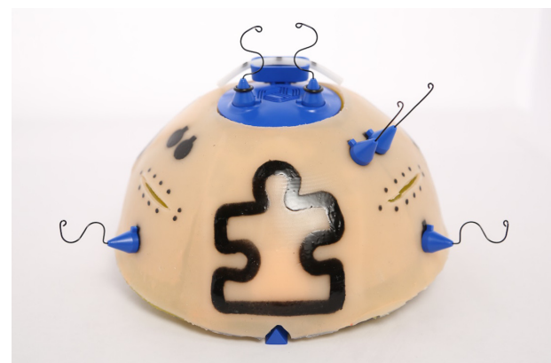
Figure 2 Fundamentals of Robotic Surgery dome device.

We believe that such a curriculum should encompass knowledge base (cognitive skill), tactile skill (psychomotor), and nontechnical skills (communication/team building). The basis for this curriculum should be surgical simulation, as it allows for safe acquisition of the necessary surgical skill in a controlled environment and then transference of this skill into live surgery. A curriculum should also be based on trainees achieving and demonstrating competence through identifiable outcome measures rather