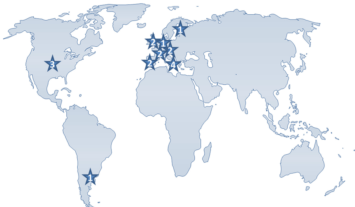
Figure 2 Geographic locations for research conducted.

Notes: Studies analyzed in this literature review included patient and clinician attitudes from the US (n=4), Italy (n=4), Spain (n=2), Germany (n=2), the UK (n=2), France (n=2), Finland (n=1), Argentina (n=1), and the Netherlands (n=1). Individual publications could include data from more than 1 country.