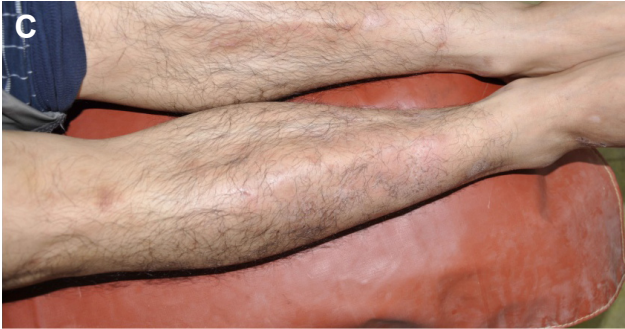
Figure I Nodular PTM treatment with compound betamethasone. Notes: (A) Nodular PTM before treatment, (B) intralesional with compound betamethasone, (C) nodular PTM complete remission. Abbreviation: PTM, pretibial myxedema.

decreased or partial remission; and 3) inefficient: the area of edema was not decreased or even deteriorated. A semimonthly return visit happened at the first 3 months and monthly then. The changes in skin lesions were observed