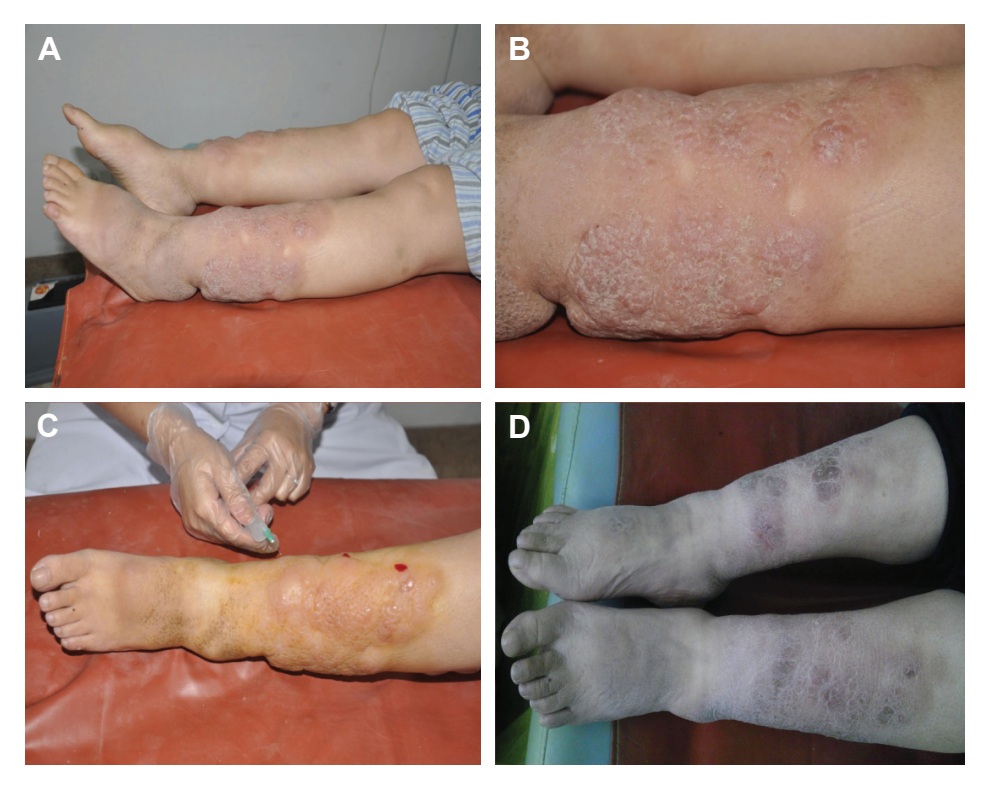
Figure 2 Elephantiasic PTM treatment with compound betamethasone. Notes: (A and B) Elephantiasic PTM before treatment, (C) intralesional with compound betamethasone, (D) elephantiasic PTM complete remission. Abbreviation: PTM, pretibial myxedema.

The most common side effects were pain and bleeding at the injection site in the treatment process of PTM.