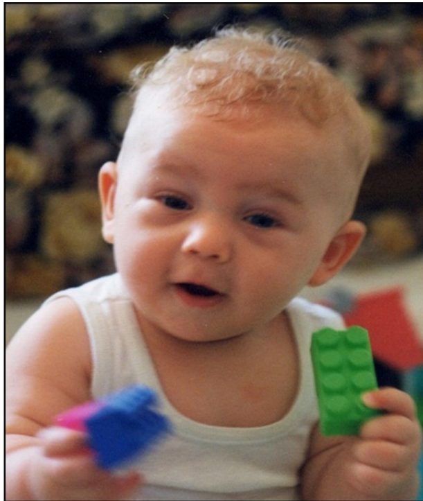
Figure 2 Facial features of the patient. Note: Our patient at the age of 13 months.

In the last few years, the use of comparative genomic hybridization array refined the molecular bases of developmental disabilities and psychiatric disorders associated with chromosome deletion/duplication. 8,9