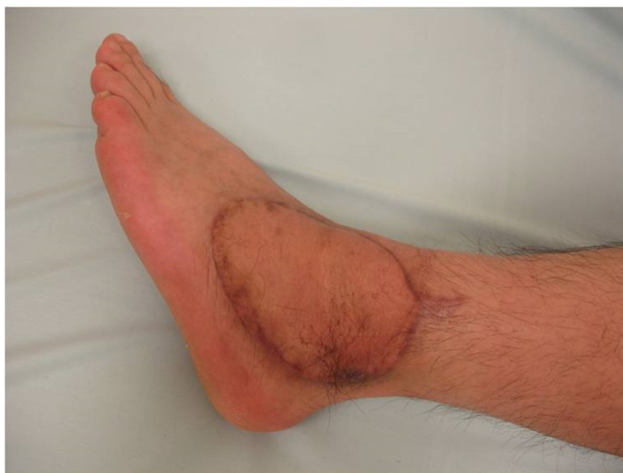
Figure 4 The flap healed well and there was no allodynia 1 year after flap surgery.