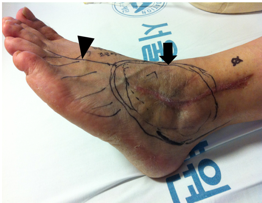
Figure 1 Allodynia (arrow, circle area) of scar tissue area and hypoesthesia (arrow head, oblique line area) on the dorsolateral side of the foot.

In the third surgery, we first widely excised the hypersensitive skin around the scar. The excised skin and subcutaneous tissue measured 13×9 cm. The superficial vein for wrapping the superficial peroneal nerve was harvested from the left inguinal area (Figure 2). The superficial circumflex iliac artery perforator flap was used to cover the skin defect. Microscopic examination of the skin and subcutaneous tissue revealed several nerve