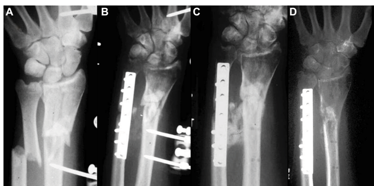
Figure 2 (A) Patient sustained open fractures of both bones and was placed in an external fixator; (B) early formation of synostosis; (C) fully mature synostosis; and (D) after successful excision of the synostosis.