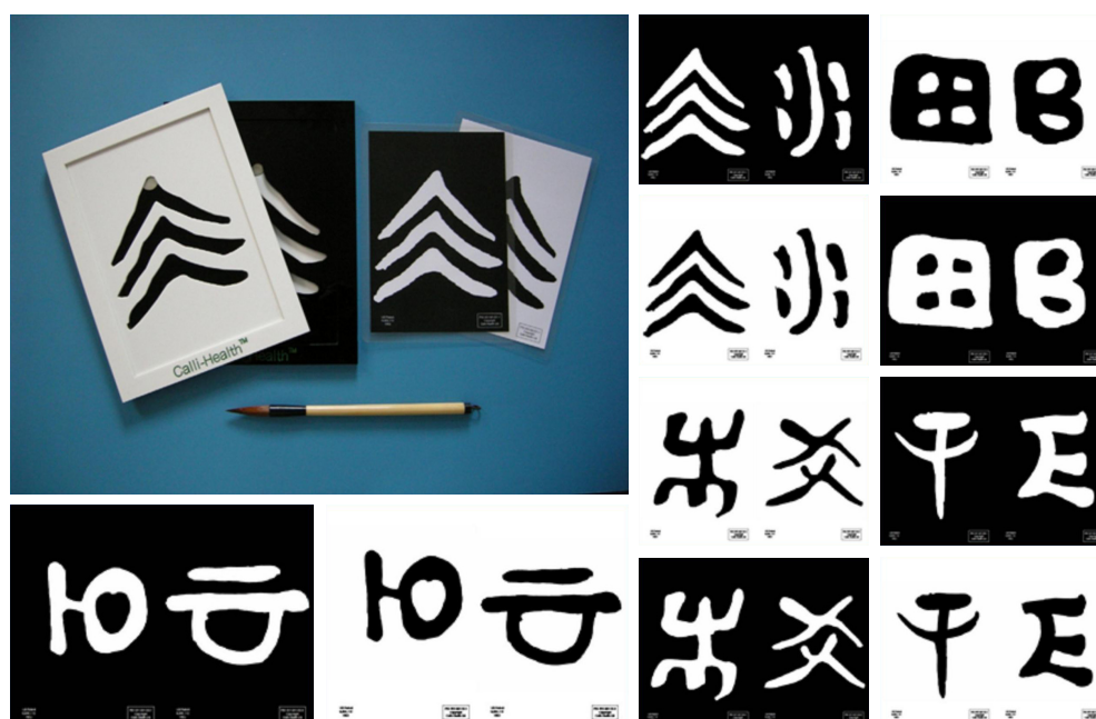
Figure 1 Some of the special characters and the design of the writing plates with grooved characters.

total of 10 character finger writing were performed for each training session. The schedule included 3–5 sessions per week and 4 weeks per month.