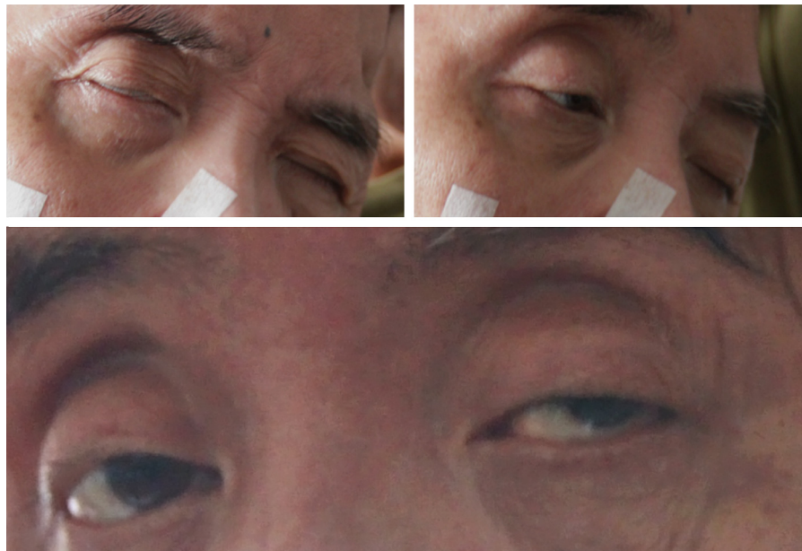
Figure 3 Stroke patient's ability to respond to object from opening his eyes from slim (top left) to moderate (top right) and to full openings (bottom). This took place gradually from the task onset and during early stage of the training session.