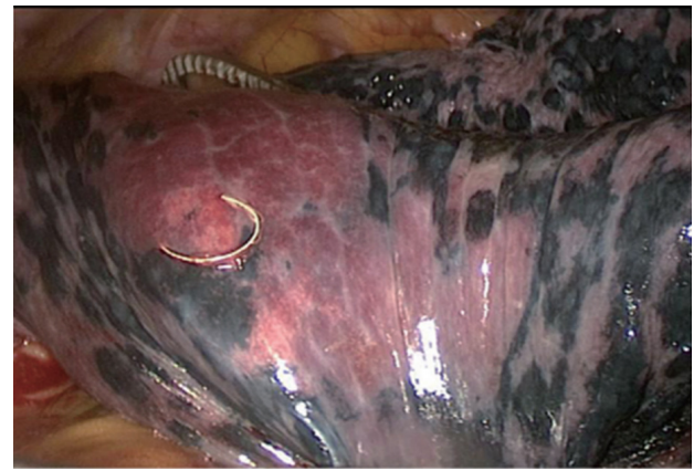
Figure 2 The deep lesion was located by the microcoil on the visceral pleura surface under thorascopic guidance.

Note: From Sui X, Zhao H, Yang F, Li JL, Wang J. Computed tomography guided microcoil localization for pulmonary small nodules and ground-glass opacity prior to thorascopic resection. J Thorac Dis. 2015;7:1580–1587. With permission from AME Publishing Company. 14