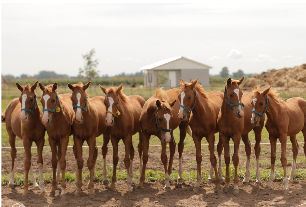
Figure 2 Eight cloned polo horses derived from the same MSC line, born in August, September and October 2016.

Abbreviations: AF, adult fibroblasts; MSC, mesenchymal stem cell; AI, artificial insemination embryos as controls.