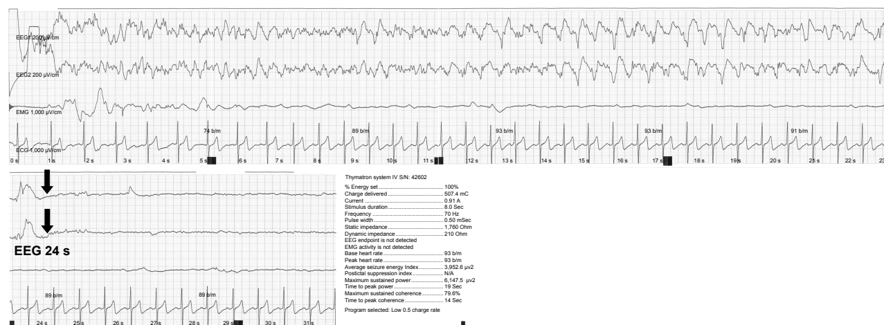
Figure 1 An inadequate response in the ninth session (bilateral brief pulse ECT, Low 0.5, 100%), in which no motor seizure was observed, and the peak heart rate did not increase from the baseline.

In the eleventh session, we switched to RUL-UBP ECT using the Low 0.25 program (0.25 ms pulse width) and titrated the stimulus dose from 5% (in increments of 5%) to determine the ST. A stimulus level of 15% enabled the induction of seizure activity, which involved tonic-clonic motor responses and was associated with low-to-mid-amplitude slow waves on EEG (Figure 2). In the subsequent sessions, the stimulus was increased to 100% (~6.7 times the ST), which produced adequate therapeutic seizures associated with high-amplitude slow waves and postictal suppression on the ictal EEGs (Figure 3). The patient exhibited clinical improvement: after the 14th session, he regained the ability to speak (albeit haltingly), which revealed the existence of hallucinations and delusions, and after the 15th session, he recovered the ability to eat. He eventually achieved complete remission, and the ECT course was terminated at the twenty-first session. He experienced muscle weakness in the lower extremities and went to a rehabilitation clinic following discharge. He remained in remission with 10 mg of olanzapine. Written informed consent was obtained from