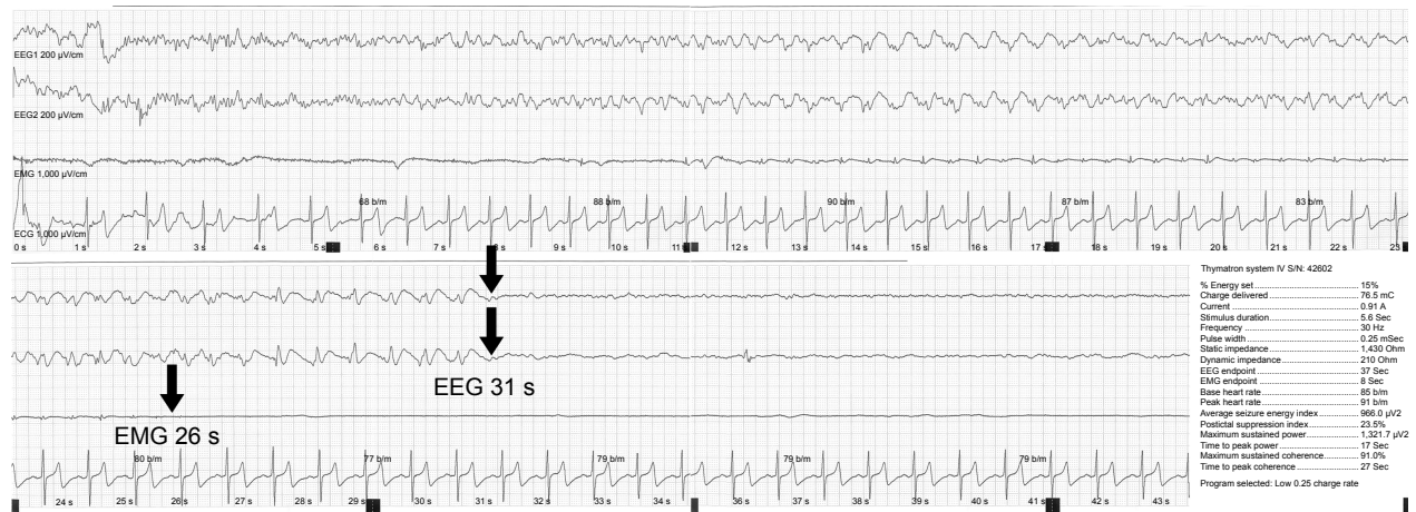
Figure 2 Successful seizure induction following the third stimulation of the eleventh session (right unilateral ultrabrief pulse ECT, Low 0.25, 15%), in which a tonic-clonic motor seizure was first observed.

Notes: EEG in channels 1 and 2, EMG in channel 3, and ECG in channel 4. The standard frontotastoid EEG electrode placements were used. The gain of the EEG amplifiers was set at 200 µV/cm, and the gain of the EMG and ECG amplifiers was set at 1,000 µV/cm.