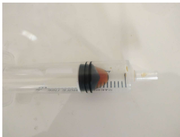
Figure 2 About 0.8 mL of a brown secretion was aspirated from the cyst of the nasal tip using a syringe.

Nasal dermoid cysts are the most frequent congenital lesions 1 and originate from the ectoderm and mesoderm. 2 These cysts are usually diagnosed in the first 3 years after birth. In some patients, however, the diagnosis can be prolonged until a later age. The oldest patient diagnosed with a nasal dermoid cyst in the literature was 56 years old. 3 Some reports have also indicated a male predominance. 4 Nasal cysts are commonly located between the glabella and columella. Intracranial extension may be incidentally found, but cranial computed tomography and/or magnetic resonance imaging are essential to identify the connection between the cyst and the extension. Cranial computed tomography clearly shows bone alterations and thus helps to achieve a diagnosis. Cysts with intracranial extension may require a more complex surgical approach or