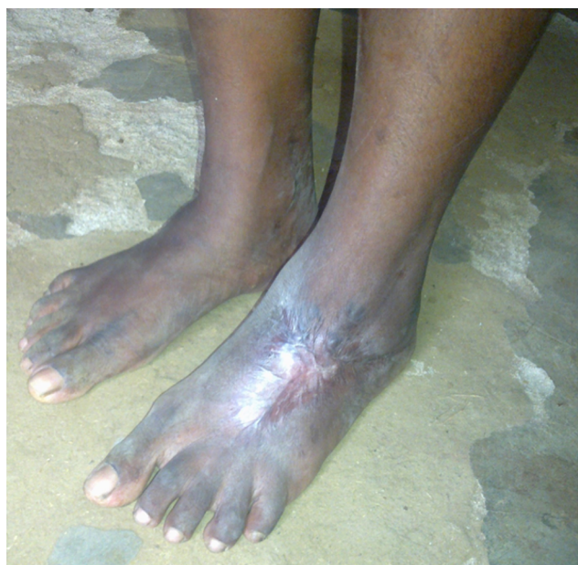
Figure 2 Soft tissue contracture of the left foot following snakebite.