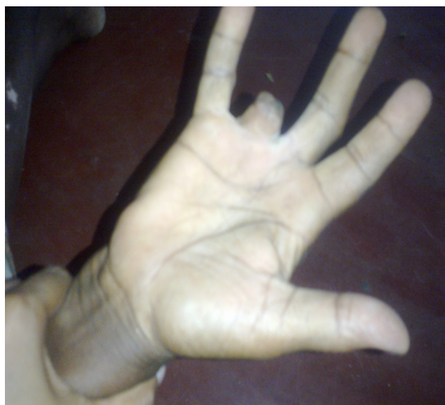
Figure 3 Amputation of ring finger of the right hand due to snakebite.

exposure to sunlight. In one, loss of vision was apparent. Russell's viper, cobra, and krait were the offending snakes in 42.9%. The complication was disabling with difficulty in reading and recognition of persons.