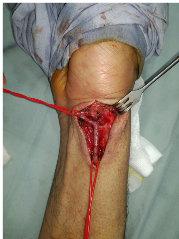
Figure 4 End-to-end anastomosis of the distal radial artery.