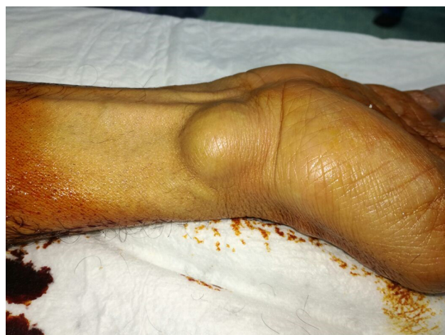
Figure 1 Right wrist swelling.