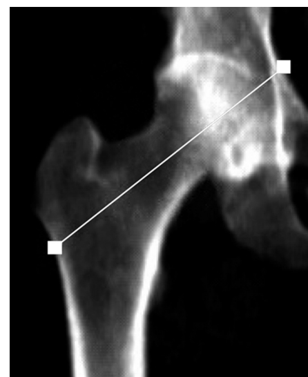
Figure 2 Hip axis length.

The dependent variable in the model was the FSI variable. The FSI values were categorized as follows: FSI > 1 (normal values); in the regression model these values were replaced by the 0 category, categorized FSI ( \text{FSI}_{\text{category}} = 0 ). FSI < 1 (pathological values); in the regression model these values were replaced by the 1 category, categorized FSI ( \text{FSI}_{\text{category}} = 1 ). A binary variable was produced with the working title \text{FSI}_{\text{category}} in the