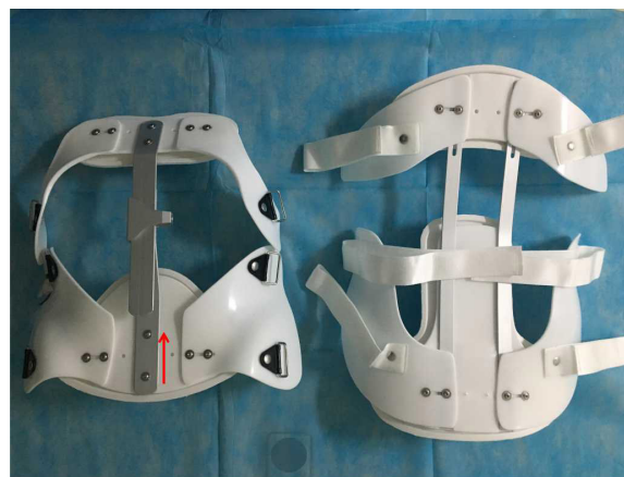
Figure 1 The spinal brace used in this study (thoracolumbosacral orthosis), which can be adjusted according to the height and weight of the patient (red arrow indicates the front side and the head side).

Demographic and operative data were recorded and compared between the two groups. The visual analog score (VAS) and vertebral body compression ratio (VCR) were recorded and compared at preoperation, on second day, at 2 weeks, 1 month, and 6 months after operation. Adjusted Oswestry Disability Index (ODI; excluding the section of sex life) was also recorded and compared for the same time points. Postoperative residual pain was defined as pain relief (VAS) of <50% on the second day after operation. In order to evaluate the efficacy of bracing after PVP for patients with postoperative residual pain, an additional separate analysis was performed for patients with postoperative residual pain. Collapse rate of operated vertebral body was compared between the two groups at 6 months after operation. Any relevant postoperative complications were recorded. The VCR was defined as the ratio between the anterior and posterior vertebral body height of the injured level. 13 Considering the