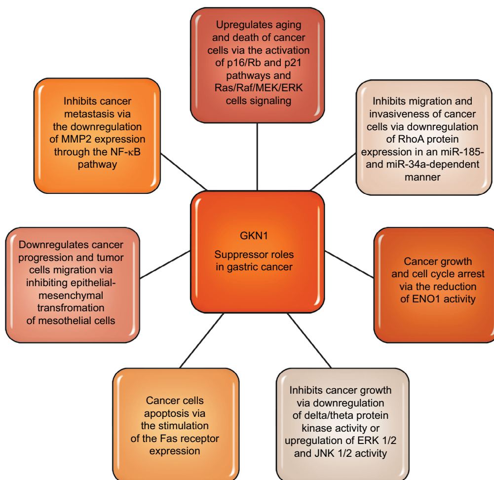
Figure 3 GKN1 suppressor roles in gastric cancer.

gastric cancer cells. The authors suggest that EBNA1 leads to the complex transcriptional and epigenetic deregulation of these tumor suppressor genes in Epstein–Barr virus positive gastric cancer. 54 Altieri et al 55 tested how GKN1 histone modification may lead to its downregulation. The authors, for this purpose, immunoprecipitated from human normal and cancerous gastric tissues chromatin for the trimethylation of histone 3 at lysine 9 (H3K9triMe) and its specific histone-lysine N-methyltransferase (SUV39H1). They found that epigenetic mechanisms responsible for GKN1 silencing in gastric cancer samples were related to high H3K9triMe levels and SUV39H1 recruitment to the GKN1 promoter. GKN1 mRNA levels were markedly increased after the inhibition of histone deacetylases with trichostatin A. 55