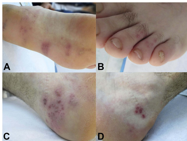
Figure 1 Clusters of vesicles located on the lateral plantar area (A), dorsal surface of digits III and IV (B), lateral aspect of the calcaneus (C and D).

The person's immune status is a key factor in determining the risk of developing herpes zoster; this can be induced by contact with a person with varicella or by reactivation of the virus in latently infected individuals. The reactivation rate of herpes zoster virus correlates with the decrease of immunity and with age. 6