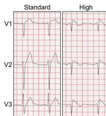
Figure 1 12-lead electrocardiographic (ECG) recordings of a 62-year old male immediately after infusion of a 1 g procainamide bolus over 20 minutes. The diagnostic type 1 ECG for Brugada syndrome is present within leads V1–V3 when recorded in the high but not standard positions.

Electrophysiological abnormalities of the right ventricular outflow tract (RVOT) are felt to contribute to the underlying substrate of BrS. 15,16 A seminal study using