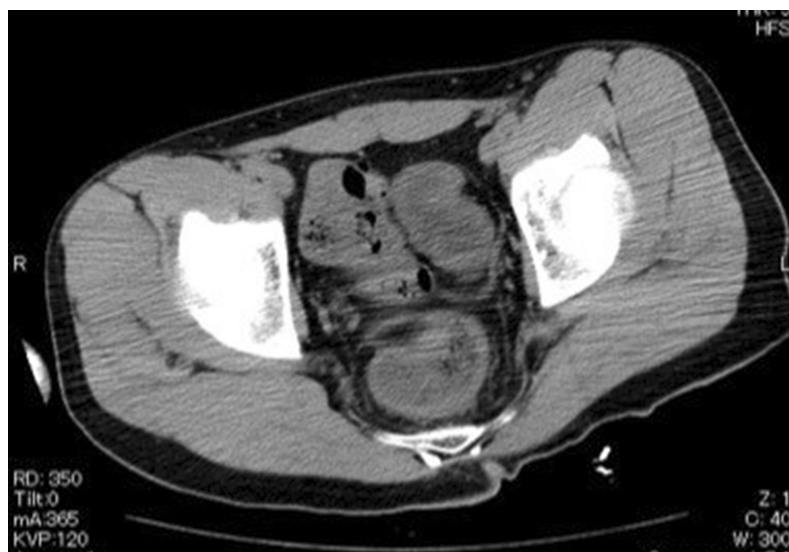
Figure 1 Wall thickening of the sigmoid colon and rectum.