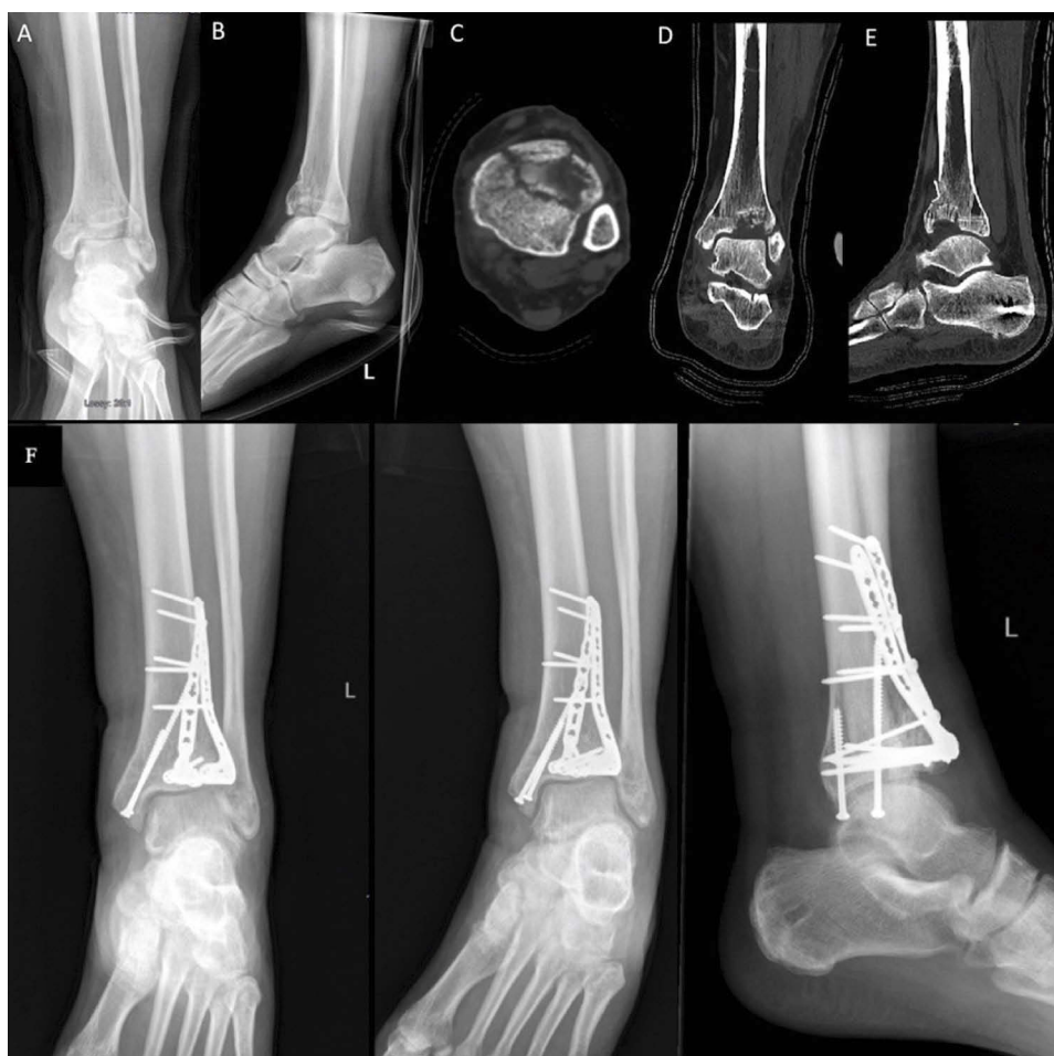
Figure 1 Fracture seen on plain radiographs ( A, B ), details of the injury further enhanced via CT ( C–E ). The CT axial cut ( C ) showing classic formation of the three main fracture fragments, Tillaux-Chaput, medial malleolus, and Volkmann. Appreciation of the depression on CT can aid the surgeon in preparation of the metaphyseal defect encountered after restoration of the articular surface. Final follow-up radiographs ( F ) demonstrating restoration of the articular surface and good anatomical alignment following open reduction and internal fixation.