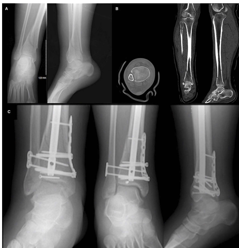
Figure 2 Fracture seen on plain radiographs demonstrating AO/OTA-43C2 (A). CT demonstrates a distal tibial spiral fracture with an associated posterior malleolus fracture (B). The articular surface was restored with the use of independent screw fixation and buttress plating. IMN was then used to correct the coronal plane malalignment. Syndesmotic screws were then used to address injury to the syndesmosis (C).

Abbreviations: CT, computed tomography; IMN, intramedullary nailing; AO/OTA, Arbeitsgemeinschaft für Osteosynthesefragen/Orthopedic Trauma Association.