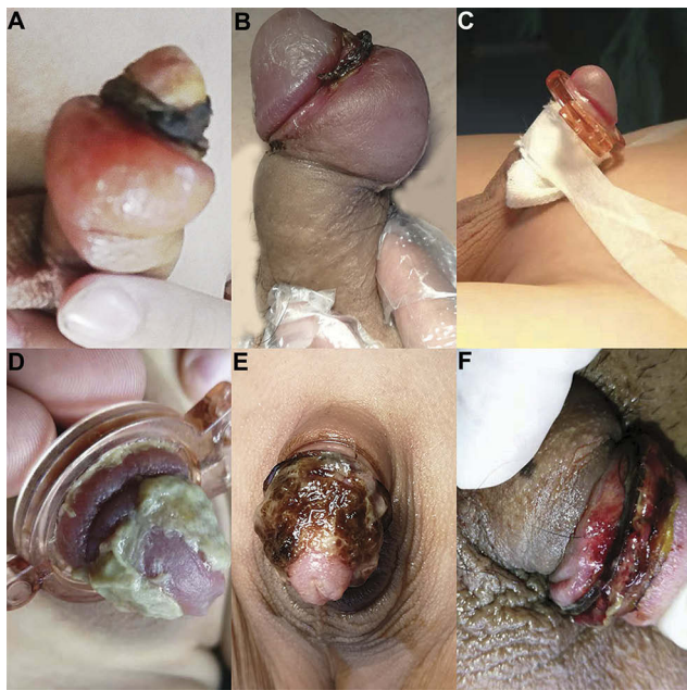
Figure 2 The types of complication. Edema and scar (A), edema in the back side of penis (B), pressure dressing (C), effusion of yellowish fluid caused by phimosis when wearing CSR (D) and CSR removal (E) and wound dehiscence (F).

not exist. In addition, patients with phimosis had lower satisfaction and higher incidence of complications than patients with redundant foreskin. For example, the incidence of total complications in phimosis was three times that of the redundant foreskin. Besides, the logistic regression results showed that age and sizes of the penis were