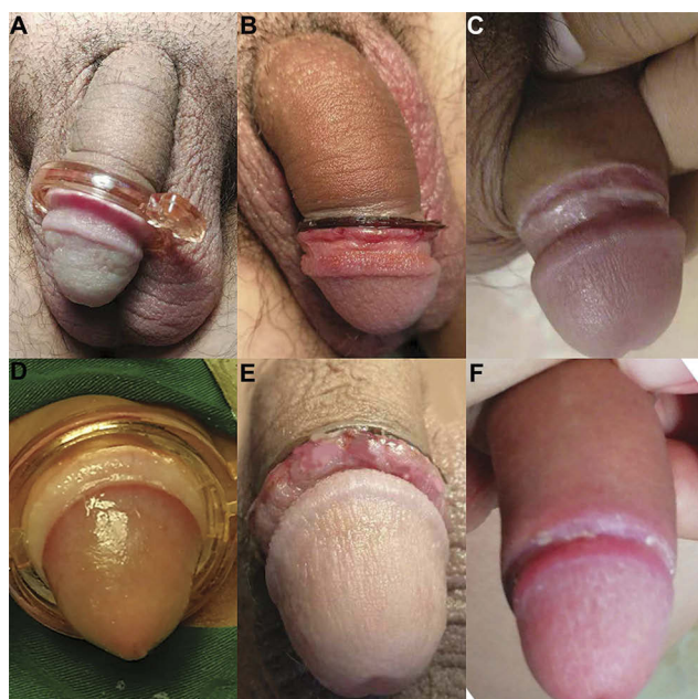
Figure 1 Normal process of circumcision with CSR. Wearing the CSR: adults (A) and children (D), the CSR removal: adults (B) and children (E) and wound healed: adults (C) and children (F).