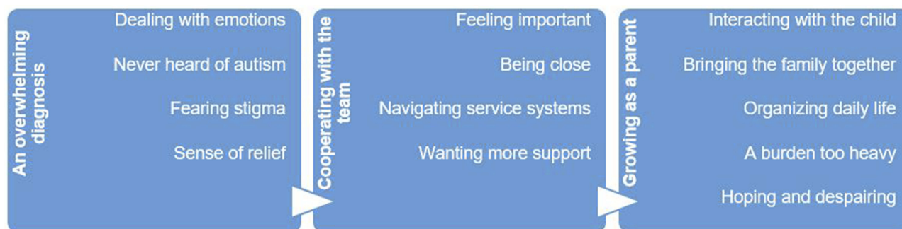
Figure 2 Presentation of the subthemes in each of the main themes.

the team. Taking an active part in the child's interventions was experienced as generating both emotional and practical consequences for the parents, which was interpreted as the third main theme, growing as a parent.