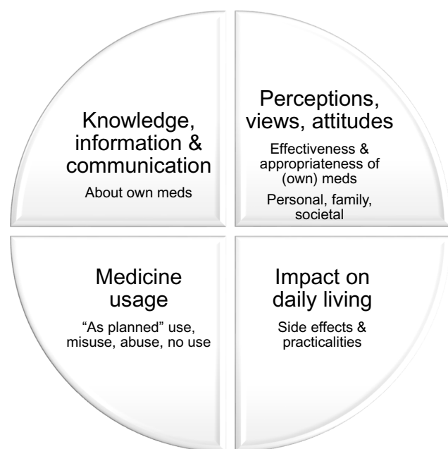
Figure 2 Thematic core categories of most meaningful/important PROs for assessment during polypharmacy medicines reviews.

Knowledge about one's own medicines, understanding the intended benefit of medicines, obtaining information and communicating about own medicines were considered the most important and meaningful PROs to be assessed during medicines reviews. Participants justified their views by raising points around the need to: Help people understand what medicines they take, what they are for, what they do, what the intended benefit is, and how to self-manage; Understand the need for more information and people's appetite for more information, while assessing any residual uncertainty; Have access trustworthy information about medicines; Ensure that the patient understands and is happy to follow the treatment plan; and Promote effective communication between patients/carers and healthcare professionals, and among providers and services.