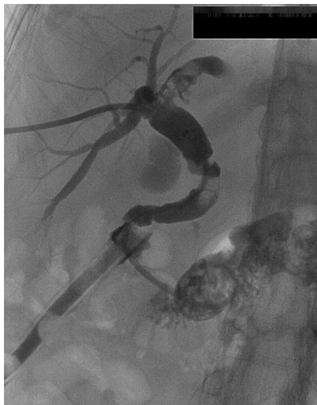
Figure 2 PTCD and DSA.

transhepatic cholangial drainage (PTCD) and digital subtraction angiography (DSA) were performed at the same time (Figure 2). The guide wire entered the duodenal stump drainage tube through the biliary tract during the operation. After repeated manipulation, the guide wire avoided the duodenal stump area and entered the duodenum. Then, 8.5F internal and external drainage tubes were placed according to the guide wire, and the contrast agent indicated good drainage. After PTCD, the patient returned to the ward in good condition. Enteral nutrition was increased while the amount of parenteral nutrition was decreased. Additionally, we washed the drainage tube which besides the duodenal stump with a slow drip of 1000 mL of normal saline for two days and paid close attention to changes of drainage fluid. Subsequently, the average daily drainage volume of the PTCD tube was approximately 800 mL. The drainage volume of the duodenal stump was significantly lower than that before PTCD, averaging about 50 mL per day. The drainage volume of the duodenal stump decreased to 0 on the 7th day after PTCD. So we intermittently clamped the PTCD tube for two days and then continuously clamped the PTCD tube for one week, during which we paid close attention to the drainage and general conditions of the patient. The