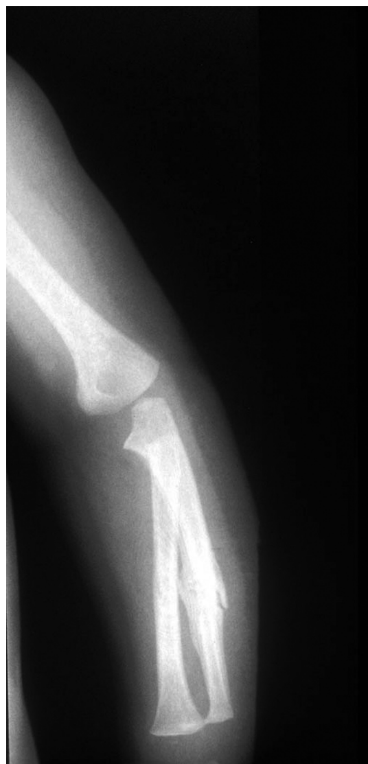
Figure 2 Left forearm to show periosteal reactions and old fracture of ulna.

carried out four days after admission. A single oral dose of 75 mg was administered and urine collected between four and six hours later. Ascorbic acid was undetectable.