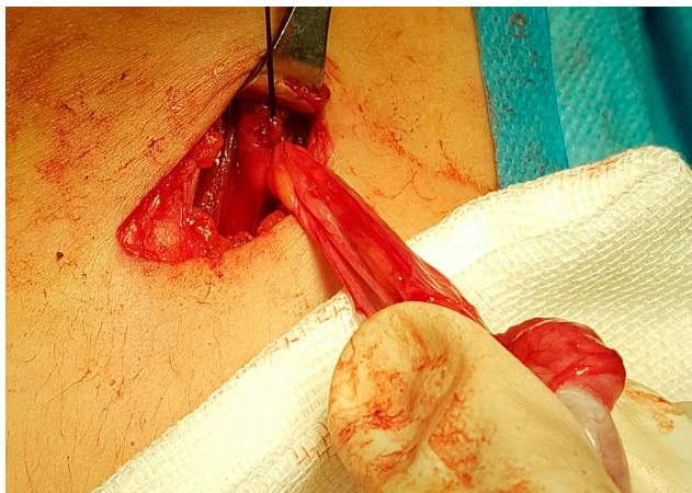
Figure 3 Closed PPV sac opening by PVST technique.

the orchiopexy was done through inguinal or scrotal incision based on the preoperative examination. Orchiectomy was performed for nubbin testes. Figure 1 shows the schematic cross-section view of the spermatic cord and PPV sac in PVST technique.