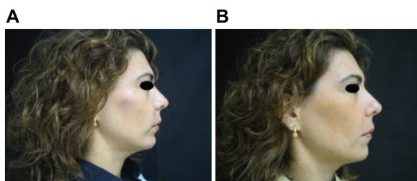
Figure 4 A 48-year-old woman. BTX-A in the upper third of the face. HA filler for mouth commissure, vermillion, malar region, and mandibular border (1.6 ml); A) before and B) after the procedure.

adequate application into the frontal, corrugators, procerus, and orbicularis oculi muscles. This resource is useful for patients aged under 50 years, who do not want or do not have clinical conditions to undergo surgery or prefer a less invasive procedure. BTX-A application can effectively offer an elevation of the lateral aspect of the eyebrow or of the mouth commissure. Thus, for the treatment of eyelid ptosis, whatever technique is used (open, endoscopic, or combined approach), previous neurotoxin application may be very useful for inhibiting or smoothing possible cutaneous and muscular creases in the treated areas. On the upper third of the face, BTX-A can attenuate the hyperdynamic wrinkles caused by muscular activity, eliminating the need for either a coronal incision in treating the frontal musculature or for an endoscopic procedure. When it is injected into the palpebral region, it is possible to obtain an elevation of the caudal portion of the eyebrow and modify its shape or position, which is useful especially when performing a blepharoplasty. This palpebral elevation (lifting effect) brings about significant