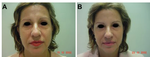
Figure 7 A 52-year-old woman. A) Before and B) after treatment with TCA peel, HA filler for nasolabials, and BTX-A in the upper third of the face.

Twenty patients (15 females and 5 males, skin type I–IV) with acne, acne scars, or actinic damage were included in an open clinical trial. All of them underwent a preparation period of two weeks before first peeling with 5% CSA solution. The peeling was performed twice a month for a total of 4 to 5 treatments. The concentration of CSA was increased to 10% by the second treatment. Patients' global assessments and physicians' global assessments of the CSA peels were considered good or better in its clinical effects in 18 of 18 and 17 of 18 patients who completed the series of peels. Two patients dropped out because of intolerance to either the preparation agents or to 5% CSA. In all other patients the treatment was well tolerated without any serious adverse effects. All patients reported some tingling sensations and desquamation 24–48 hours after the procedure. There was no downtime from work. There is some evidence that smoking might negatively affect the efficacy of CSA peels. CSA peels are well tolerated in most patients of skin type I–IV with improvement of inflammatory acne lesions, facial acne scars, radiance, pigmentary changes, and fine wrinkling. 37 Future researchers could investigate the performance of repeated series every other year.