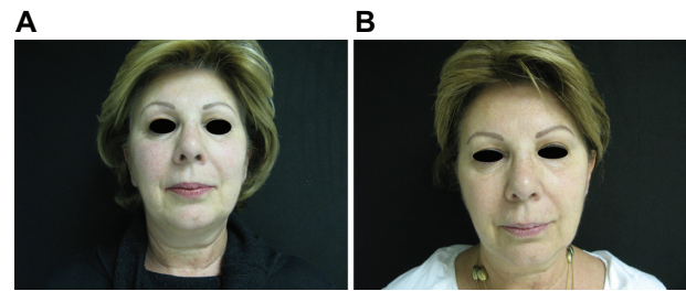
Figure 5 A 52-year-old woman. A) Before and B) after full face trichloroacetic acid (TCA) peel, BTX-A for the depressor anguli oris and the upper third of the face. 1.2 ml of HA filler was injected in both the nasolabial fold and oral commissure.

appearance of rejuvenation as well as the improvement of “crow’s feet”. By using this combination, it is possible, in selected cases, to decrease the quantity of skin to be removed and consequently, to decrease the scar dimension. Although many researchers promote its postoperative use, there is no consensus as to the ideal time of application in these cases.