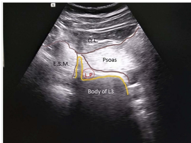
Figure 1 The Lumbar Plexus Block.

Abbreviations: E.S.M., Erector Spinae Muscle; Q.L., Quadratus Lumborum; L.P., Lumbar Plexus.