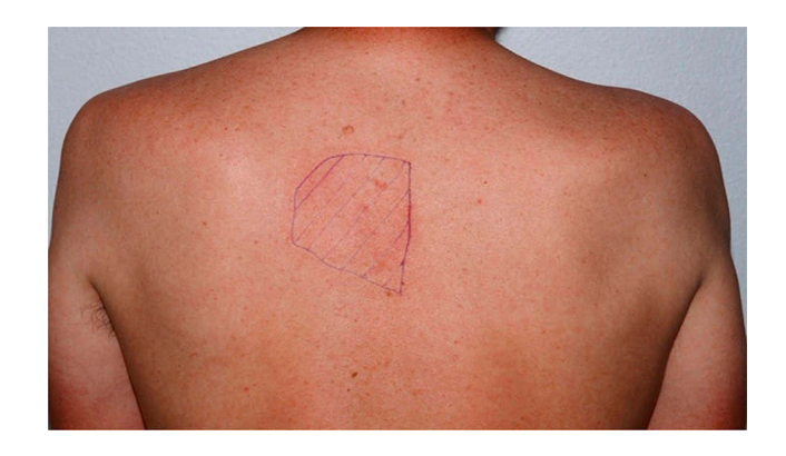
Figure I Approximate Localization of Pruritus.

Notes: The above illustration is not of the actual patient. The area depicted is located in the interscapular region/upper back similar to the symptomatic area of the actual patient.