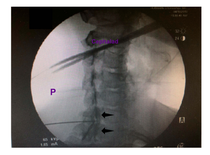
Figure 2 Fluoroscopic Image of C7-T1 Cervical Epidural Steroid Injectio.

Notes: The above illustration is not of the actual patient. The area depicted is located in the interscapular region/upper back similar to the symptomatic area of the actual patient.