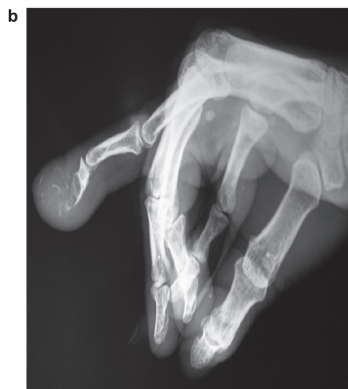
Figure 2b X-ray (lateral view) showing intraosseous epidermoid cyst of distal phalanx of right ring finger.