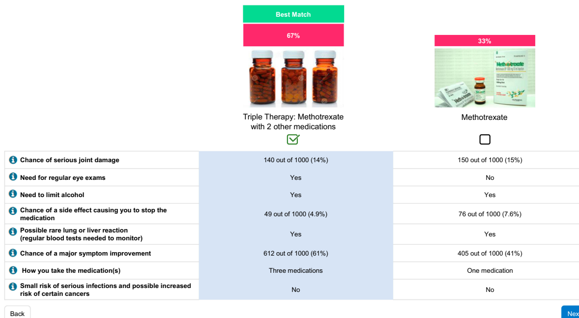
Figure 2 Screenshot of the final display of patients predicted choice.

Please read the information below and make the final choice YOU prefer (as always, there is no right or wrong answer). Click next to continue.