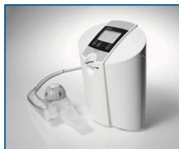
Figure 2 Examples of novel marketed nebulizers. Examples of the different types of commercially available nebulizers that incorporate newer aerosol generating technologies. PARI LC® Sprint (PARI, USA 83 ); SideStream Plus® (Philips, USA 84 ); AeroEclipse® II (Monaghan Medical Corporation, USA 85 ); Micro Air® NE-U22 (Omron Healthcare, USA 86 ); AKITA2® APIXNEB (PARI Pharma GmbH, Germany 87 ).

(FEV 1 ) when compared with placebo. 44,45 No significant differences were observed between these two treatments in terms of efficacy, cost, occurrence of AEs, or hospitalizations. 46 With regard to nebulized SAMAs, nebulized ipratropium demonstrated significant improvements in FEV 1 within 15–30 minutes, which persisted for 4–5 hours. 47 Furthermore, clinical studies of dual ipratropium-albuterol have demonstrated improvements in FEV 1 versus both albuterol or ipratropium alone. Ipratropium-