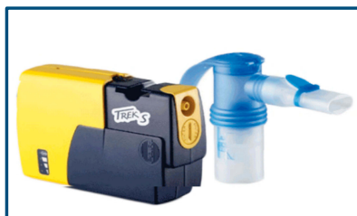
Pari LC® Sprint (PARI, Midlothian, VA)