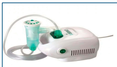
AeroEclipse® II (Monaghan Medical Corporation, Plattsburgh, NY)