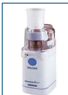
Micro Air® NE-U22 (Omron Healthcare, Bannockburn, IL)