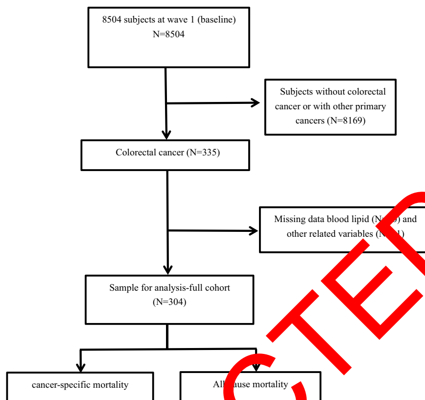
Figure 1 The flow chart of subjects included in the study.

the Ethics Committee of The First Affiliated Hospital of Nanchang University approved this study.