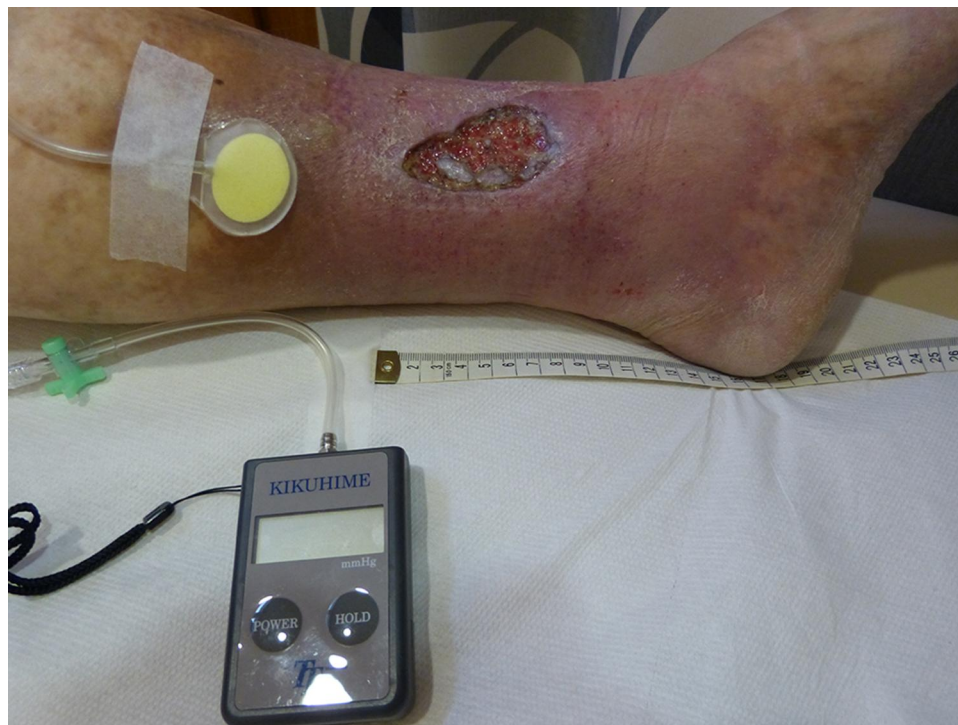
Figure 1 Measurement of sub-bandage pressure using the Kikuhime device.

bandages in a standing position, the pressure dropped from 80 mmHg to 50 mmHg (37.5%), and overnight to the next day from 77 mmHg to 37 mmHg (~52%). After the third day of bandaging, it was observed that the pressure loss under bandages between 08:00 and 09:00 am and 13:00 and 14:00 pm stabilized as the limb edema was reduced. Bandages application was continued twice daily in the first week of therapy due to the presence of an oozing wound.