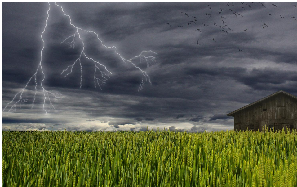
Figure 2 Picture of all elements required for a thunderstorm asthma epidemic: storm activity, presence of aeroallergen (in this case grass pollen), and human presence as shown by building.

near-surface air warming effects. 31 Secondly, changes to climate alter the growth patterns of allergen-producing plants and the production and dispersion of triggering pollens; with increasing atmospheric carbon dioxide levels predisposing plants to produce more pollen, this could substantially increase the risk of severe thunderstorm asthma events. 29 Thunderstorm asthma events are also more likely to occur in previously unaffected regions and outside of usual seasons due to these changes.