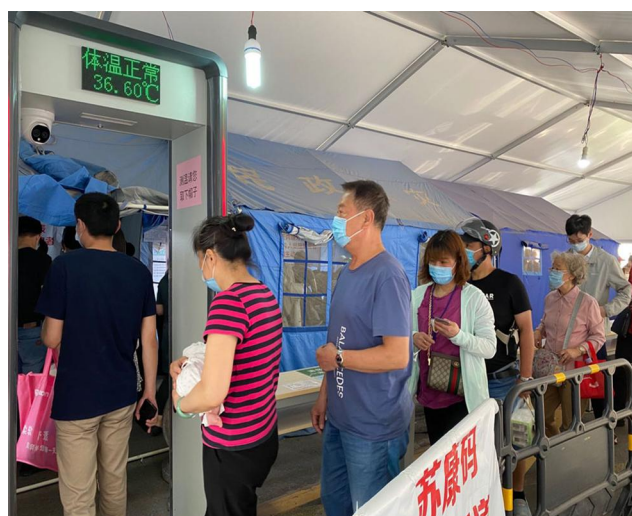
Figure 2 Automatic measurement of body temperature and triage at the entrance of hospital.

splash. During processes such as tracheal intubation, noninvasive ventilation, tracheotomy, cardiopulmonary resuscitation, manual ventilation before intubation, and bronchoscopy in suspected or confirmed COVID-19 patients, many protective methods were implemented. They were minimization of aerosols via air isolation measures, wearing medical protective masks, routine airtightness testing, wearing goggles or a face shield for eye protection, wearing gloves and long-sleeved gowns to protect against body fluid penetration, performing procedures in a well-ventilated room, and limiting the number of people in the room to the minimum amount possible while maintaining adequate patient support. 12