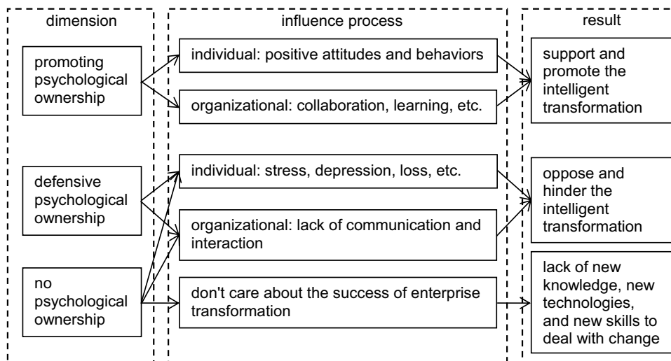
Figure 2 The influence process and mechanism of different organizational-based psychological ownership on enterprise intelligent transformation.

promoting psychological ownership is conducive to improving employees' job satisfaction in the process of change, 36 increasing employees' understanding and identification of their work and gaining a sense of efficacy, and enhancing employees' sense of belonging and gain, 37 thus effectively inspiring individual employees' sense of identity and trust in the intelligent transformation, enabling the enterprise to further increase the investment in intelligent technology and equipment, optimize the management system and management process, then form a perfect and efficient intelligent management system. Thirdly, promoting psychological ownership can also be effective in promoting employees' sense of responsibility, which makes employees willing to sacrifice their personal interests for the organization when facing possible conflicts of interest in the process of enterprise intelligent transformation, thus contributing to the smooth realization of the transformation and upgrading goals of manufacturing companies. In addition, promoting organizational psychological ownership can also enable employees to more actively make positive behaviors that are conducive to change in the process of the enterprises' intelligent transformation, this not only can effectively save the cost of management in the enterprise, but the employees' active behavior will play a greater role in promoting the intelligent transformation of manufacturing enterprises than passive behavior.