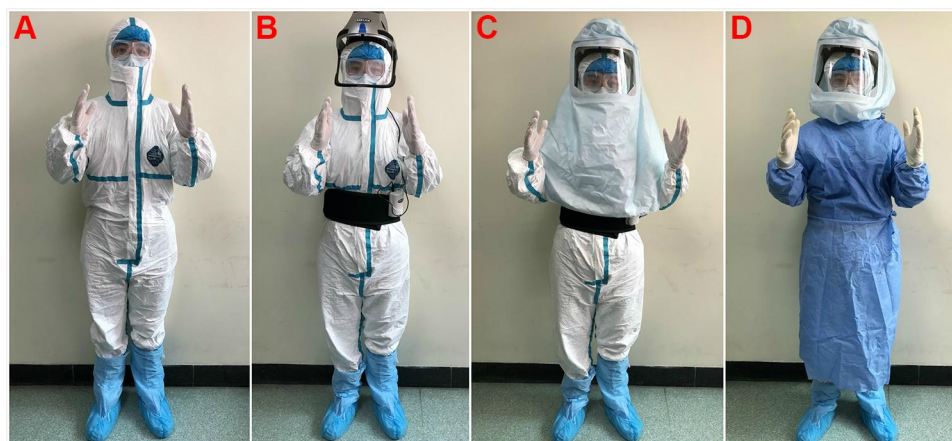
Figure 2 Participant's process of donning personal protective equipment. Two layers of personal protective equipment combined with powered air-purifying respirator (PAPR) (A): the protective cover-all with hood- Inner layer personal protective equipment, (B) Wear a PAPR, (C and D): Outer personal protective equipment with a hood PAPR.