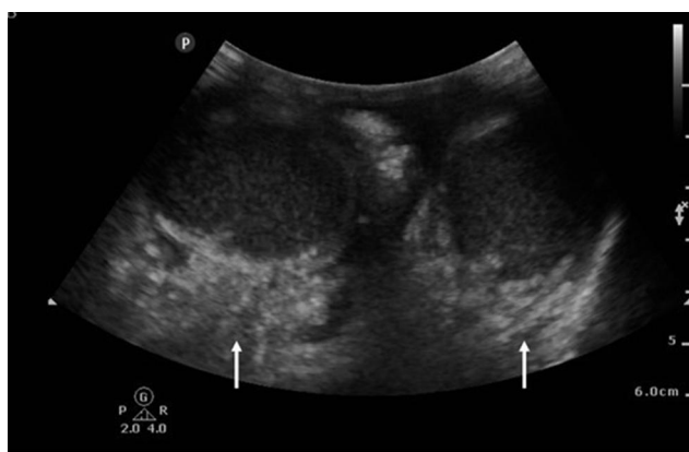
Figure 4 Point of care ultrasound image of the scrotum. Note the diffuse subcutaneous edema and subcutaneous gas adjacent to the testicles (white arrows). Case courtesy of Praveen Jha. Fournier gangrene. Radiopedia.org. rID: 18695. Available from: https://radiopaedia.org/cases/fournier-gangrene-1?lang=us . 100

Additionally, POCUS application in suspected FG can differentiate between NSTI findings from other urogenital diseases that may result in scrotal pain, erythema, and swelling. 86