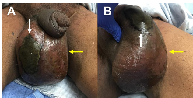
Figure 1 Physical examination findings of Fournier Gangrene. Note a large area of necrosis (white arrow) as well as soft tissue edema and erythema (yellow arrow).

The LRINEC score aggregates data including C-reactive protein, extent of leukocytosis, hemoglobin, serum sodium, serum creatinine, and glucose to suggest presence of NSTI (Table 2). The score explicitly cannot exclude NSTI. Score ranges from 0 to 13 with composite scores \geq 6 concerning for NSTI. 66 A significant drawback of the LRINEC scoring system is its poor sensitivity among ED patients. 67 One large study of the LRINEC score performance in the emergency setting found sensitivity for FG ranging between 68% and 80%, unacceptably low given the marked mortality associated with delay to definitive surgical management. 63,66–69 There have also been cases of NSTI with LRINEC scores of zero. 70 Due to the limited sensitivity of the LRINEC, it should not determine clinical decision-making for FG diagnosis, particularly in the ED setting.