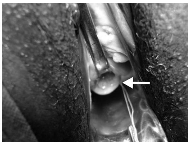
Figure 1 Arrow showing intrauterine contraceptive device thread coming through posterior fornix.

motion tenderness, nodularity, and tenderness in the pouch of Douglas. Her abdominal radiograph revealed an IUCD misplaced in the pelvis (inset, Figure 2), and transvaginal ultrasonography revealed the IUCD in the pouch of Douglas. The patient was planned for laparoscopic removal of IUCD but due to dense adhesions between the posterior surface of the uterus and rectosigmoid junction, the procedure was converted to a laparotomy (Figure 2). After careful dissection, the vertical limb of the IUCD was visualized under the serosa of the rectum. The IUCD was removed and the serosal tear at the rectosigmoid junction repaired. Postoperative recovery was uneventful.