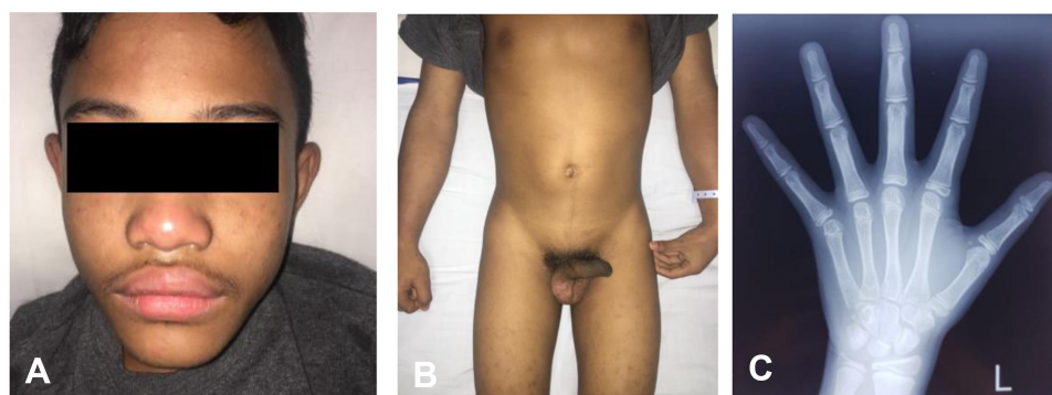
Figure 1 Acne and facial hair (A) and enlarged penis with scant pubic hair (B) in a 6-year-old boy, showing signs of precocious pseudo-puberty as shown on both cases. Advanced bone age of Case 2 (C).

A 6-year-old boy with an enlarged left testicle starting 3 months before the presentation. Enlarged left testicle was painless without signs of inflammation, while the right testicle was normal. The pubertal state was A1P3G3 (see Table 1 ).