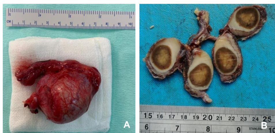
Figure 3 Macroscopic anatomy findings of the left testis from the patient of Case 1 (A) and Case 2 (B). Note a well circumscribed yellowish-brownish mass inside the testis.