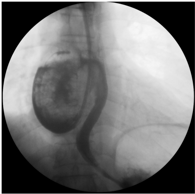
Figure 2 Esophagogram demonstrated the "mass" is a giant esophageal diverticulum filled with food debris, no evidence of contrast medium leakage, and showed the distal esophagus was unobstructed without contrast agent stasis, and the mucosa and structure at the gastroesophageal junction were normal. Two nasogastric tubes were inserted (one was inserted into the esophagus for suction residual chymus, the other was inserted into the stomach for supplying nutrition).