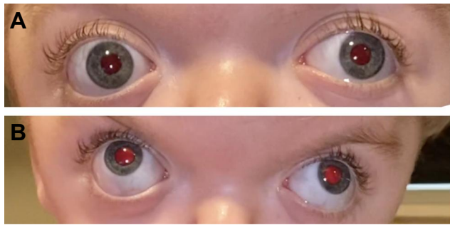
Figure 2 A 2-year-old child with syndromic craniosynostosis demonstrating “exco-lotorsional syndrome” in the (A) primary gaze and with (B) V-pattern exotropia that is prominent in upgaze.

a retrospective study of 140 craniosynostosis cases that only 9 patients demonstrated changes in ocular position after undergoing reconstructive operations; this led to the proposal that strabismus surgery should be pursued earlier in life, as the benefit of achieving binocularity may outweigh the comparatively small risk of future shifts in ocular position. 19 Further studies are needed to definitively compare outcomes between early and late surgery in the management of craniosynostotic strabismus. Even when strabismus surgery is performed, however, the complex anatomy of these patients makes a curative outcome difficult to achieve. In a retrospective review of 14 craniosynostosis patients that underwent strabismus surgery, Coats et al found that all patients had significant postoperative residual oculomotor dysfunction. 20 Orbital imaging, preferably MRI, can be helpful in preparation for surgery and is particularly useful in cases when there are positional or numerical abnormalities in the extraocular muscles. 21