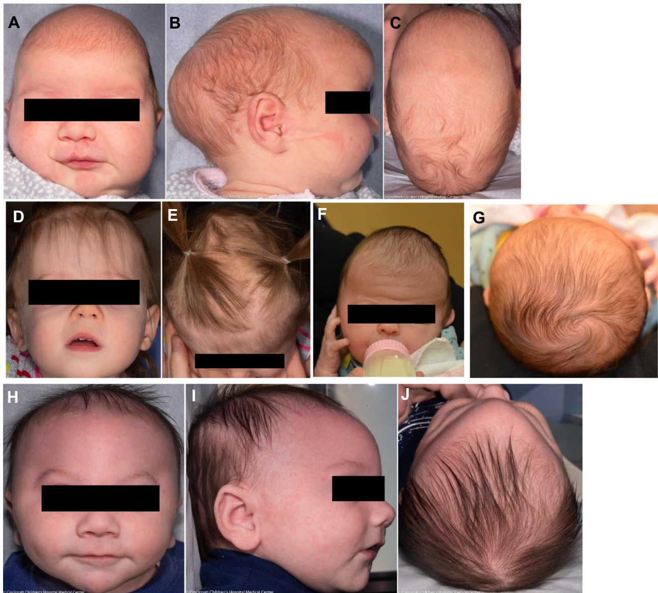
Figure 1 (A–C) A child with sagittal craniosynostosis demonstrating scaphocephaly with a long, narrow skull and increased AP (anterior-posterior) skull length. (D and E) A child with unicoronal craniosynostosis with notable anterior plagiocephaly . (F and G) A child with bicoronal craniosynostosis demonstrating brachycephaly with broad forehead and reduced AP skull length. (H–J) A child with metopic craniosynostosis demonstrating trigonocephaly or triangular skull shape and a prominent, vertical forehead ridge.

(86%) of eyes. 11 Conversely, Tay et al found that only 4/63 (6.3%) of patients with syndromic craniosynostosis had visual loss attributable to amblyopia. 12 Gray et al identified that amblyopia led to visual impairment in 12/56 (21%) of patients with Crouzon syndrome. 13 For comparison, longitudinal population data for children ages 4–10 yields a 2.9% prevalence rate for amblyopia. 14