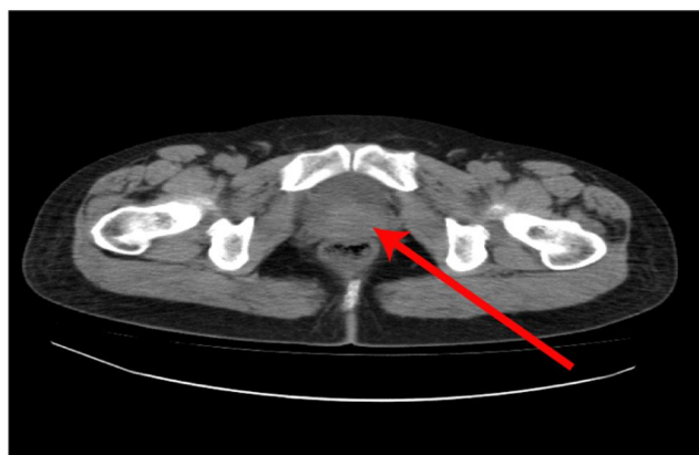
Figure 1 A CT scan of the pelvis showing a mass arising from the posterior wall of the vagina. The tumor mass showed invasion of the posterior vaginal wall without rectal invasion or pelvic floor musculature (red arrow).

resected with negative margins and sent for pathologic evaluation. Gross examination showed a whitish, solid mass measuring 5.5×3.3×3 cm. Microscopically, the tumor comprised densely spindled cells with an interlacing fascicular pattern. The spindle cells showed high nuclear abnormalities with elongated plump nuclei and coarse chromatin texture and fibrillary cytoplasm. Coagulative tumor necrosis was identified. Up to 14 mitotic counts per 50 high power field (HPF) were counted. Immunohistochemical staining was strongly positive for DOG-1, c-Kit protein (CD117), and CD34 and negative