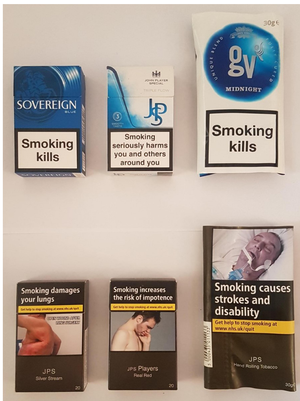
Figure 1 Examples of flip-top cigarette packs and rolling tobacco pouches pre-standardized packaging (top row) and post-standardized packaging (bottom row).

2020 for the second 16 ). Academic topic experts were also contacted.