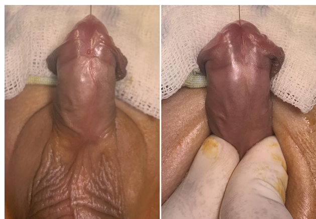
Figure 3 “Spongiosal plate” and “urethral plate” in distal penile hypospadias. The left photo shows the narrow glistening urothelial sheet overlying the interbulbar commissure “ie, urethral plate”. The right photo shows the augmented silhouette of the spongiosal plate from its bifurcation to its destination achieved by modest compression at the penile root. It favorably seemed not-linked to the poor condition of the “urethral plate” in both width and depth.

Adequate exposure of the corpus spongiosum was planned at operative dissection, from its bifurcation to its termination at the natural glanular ventral meatal