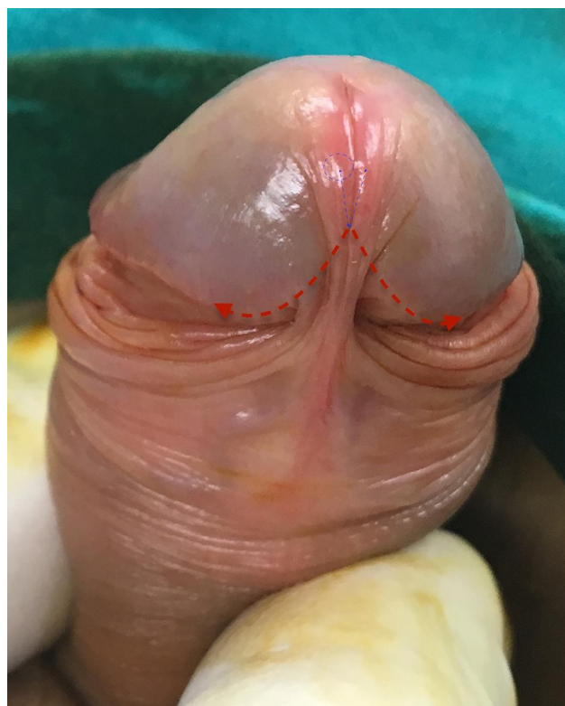
Figure 1 Topographic mapping of the meatal marks and glans wings among the control cohort. The blue dotted line represents the converging alignment of the glans wings in-between the side protrusions and ventral endpoint of the meatus. The red dotted arrows represent the diverging glans wings alignments over the ventrolateral aspect of the corpus spongiosum.