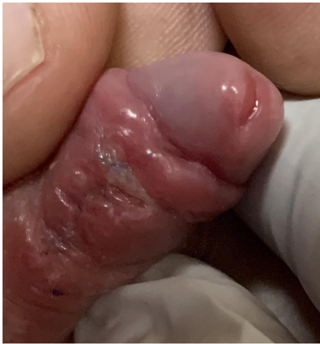
Figure 5 Early postoperative skin infection and partial dehiscence.

a fully epithelialized neourethra (after has been boosted with local skin flaps or grafts) or by relying solely on the plate for the reconstruction of an incompletely epithelialized neourethra, hoping for secondary healing with minimal scarring. 10,11