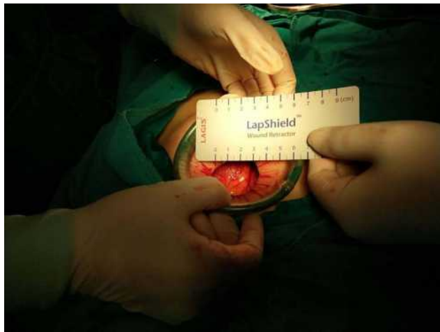
Figure 2 A trans-umbilical skin incision of a transversal length of 3 cm was made.